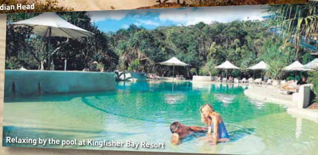
Relaxing by the pool at Kingfisher Bay Resort